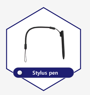
US20-STYL Spare Stylus with tether for US20

US20-STRP-(S10 or S50) Hand strap for 45° Scan US20 (10 pcs or 50 pcs) US20-STRP-(E10 or E50) Hand strap for 0° Scan US20 (10 pcs or 50 pcs)